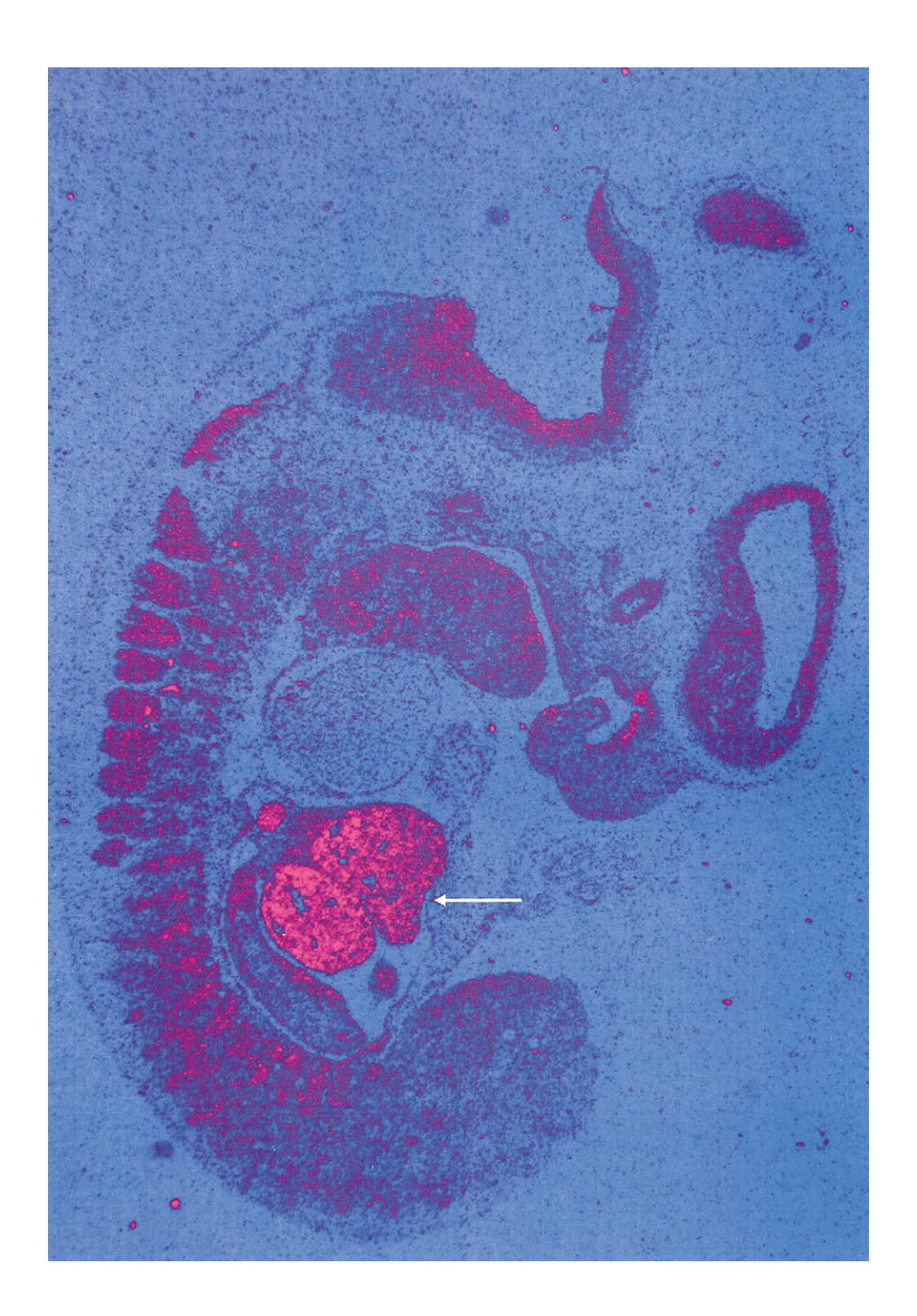
Figure 3 Embryonic expression of Cirhin . In situ hybridization on a sagittal section of a day-11.5 mouse embryo with a 3' probe showed prominent expression of Cirhin in the liver ( arrow ) and much weaker levels in the somites, brain, and craniofacial structures. Probe 1 specific to the 5' portion of Cirhin gave identical results, whereas the corresponding sense probes showed no detectable signals. The mouse primer sequences for amplification by RT-PCR of probe 1 (5' fragment of the gene) are 5'-CAG ATT GGC TGT TTC ACG AAC and TGT TGC CTA TCT AAA ACC ATC, and those for probe 2 (3' fragment) are 5'-CTT TCC AGC CGC AGT CAG GTA and 5'-CCG CCT CAA GAA GAC ATC TGA T. Total adult mouse liver RNA was used as a template for the RT-PCRs.